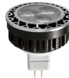
4W: TS-40MR16 5.5W: TS-60MR16

Power: 3W LED CCT: 2700K Beam: 360° Lumens: 300