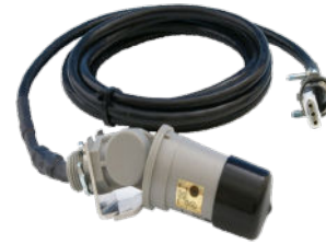
9": TS-TPHOTO9 15': TS-TPHOTO

Black direct burial polyvinyl chloride (PVC) coated copper low voltage wire. Available in 12/2 or 14/2 in 250 ft. length.