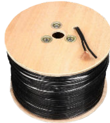
12/2: TS-122G250 14/2: TS-142G250

Input: 120VAC, 50/60Hz Output Voltage: 9V – 15V AC Includes Built-in Mechanical Timer Dimensions: 4.3"(W) x 6.7"(H) x 4.3"(D)