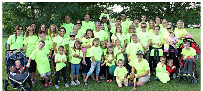
2014 Annual "Walk the Walk for Autism"